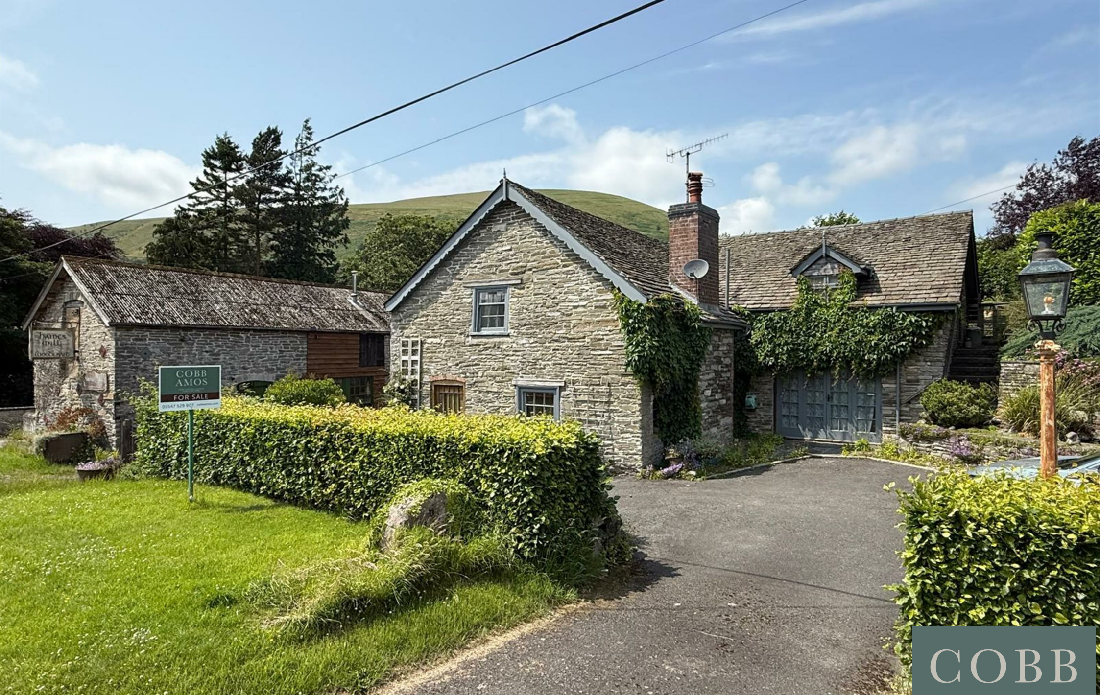
Haines Mill, HOUSE with DETACHED BARN,, New Radnor, LD8 2TN Offers In The Region Of £435,000